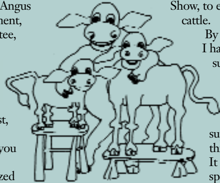
DONETA BROWN ILLUSTRATIONS